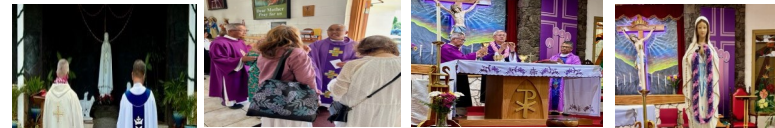
Immaculate Conception * December 9, 2024