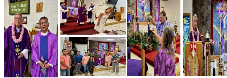
Lighting of Advent Wreath * December 8, 2024 with Visiting Priests