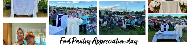
Food Pantry Appreciation day