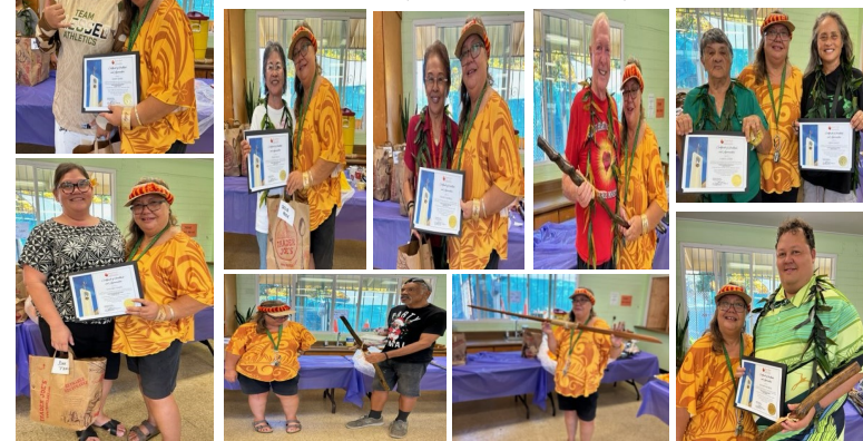
Filipino Catholic Club Gathering, Dec. 8, 2024