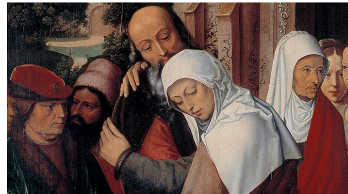
On July 26, we celebrate the Memorial of Saints Joachim and Anne, Parents of the Blessed Virgin Mary

NOTE: PLEASE DO NOT PLACE YOUR MASS INTENTION IN THE OFFERTORY BASKET IF IT FOR THE UPCOMING WEEKEND. PLEASE TURN INTO OFFICE DIRECTLY FOR THE WEEKEND. WE CAN NOT GUARANTEE YOUR INTENTIONS WILL BE IN THE BULLETIN OR READ. Mahalo.