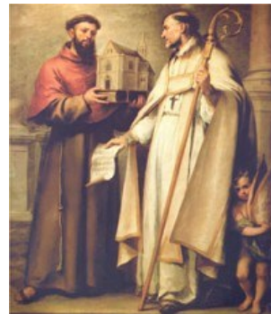
Feast Day: July 15